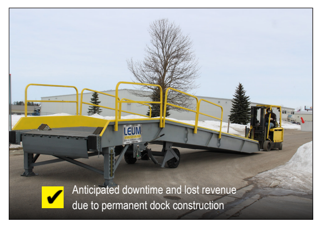
Arrives in 6-8 weeks, ready for loading duties