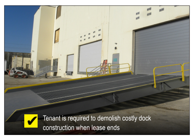
A Dock to Ground Ramp is easily removable at time of reclamation