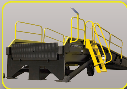
Optional - Mobile Design with Solid High Capacity Wheels